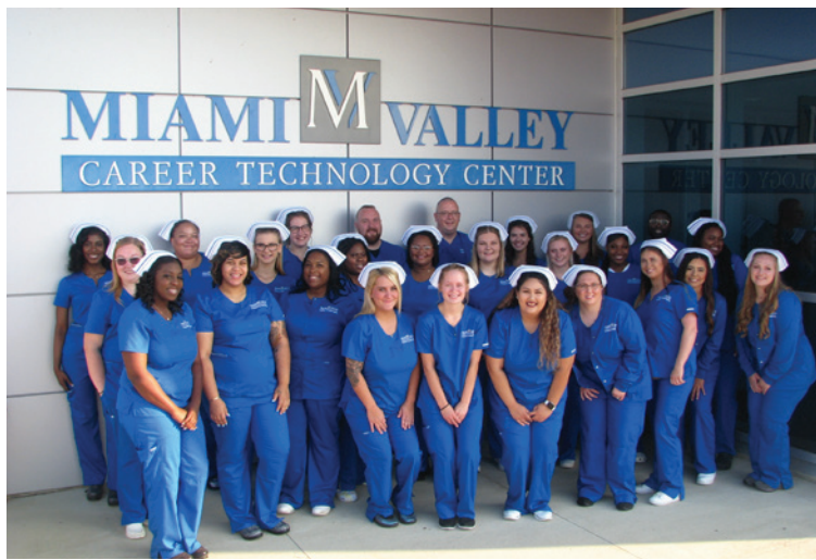
MVCTC Adult Education Practical Nursing Program celebrated the graduation of 27 Practical Nursing students in September 2021.