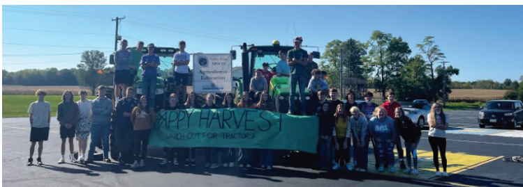
On Wednesday, September 29th, Valley View MVCTC FFA members set up an Ag Safety Awareness Display. The purpose was to bring awareness to the beginning of the harvest and the importance of road safety.