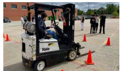
Wayne students are learning forklift and aerial lift training as well as ladder safety in the first few weeks of the new Construction Technology Class offered through a partnership between Huber Heights Schools and MVCTC.